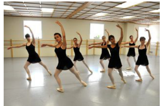
Ballet 4A Class